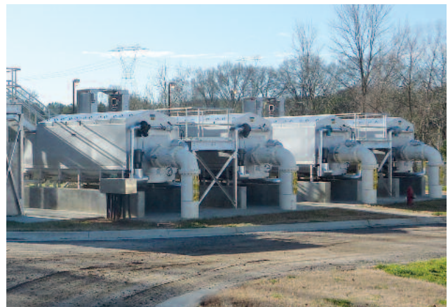
4 RoDisc® Rotary Mesh Screen units with 18 discs installed in a concrete tank