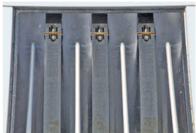
Backwashing of filter discs with filtrate – no external wash water required