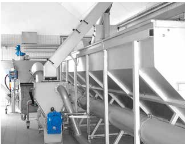
Intensive washing of screenings in a WAP® SL subsequent to a HUBER Complete Plant ROTAMAT® Ro5.