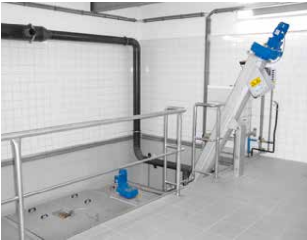
Integrated grit washing at the end of the HUBER Complete Plant ROTAMAT® Ro5.