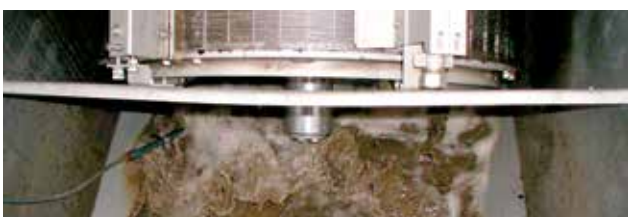
Well-proven wastewater fine screen: HUBER Rotary Drum Fine Screen ROTAMAT® Ro2.

Other separation sizes can be supplied on demand. Separate brochures are available for all of these machines.