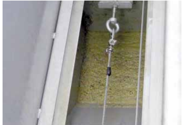
Paddle scraper for grease removal from the grease trap. According to the principle of a longitudinal grit removal scraper the grease paddle pushes the floating fat and grease into the pump sump.

chamber by the aeration system transports the grease through the slotted scum board into the grease chamber. In contrast to many competitors, the floating fats and oils are skimmed off the water surface with a paddle scraper that is slowly pulled with a stainless steel rope. The paddle is shaped so that it removes virtually all floating matter from the grease trap. Anaerobic degradation of fat and grease, and there-with odor nuisance, is thus prevented.