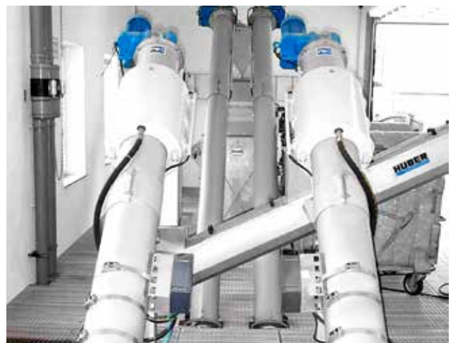
Underground, redundant HUBER Complete Plant ROTAMAT® Ro5.