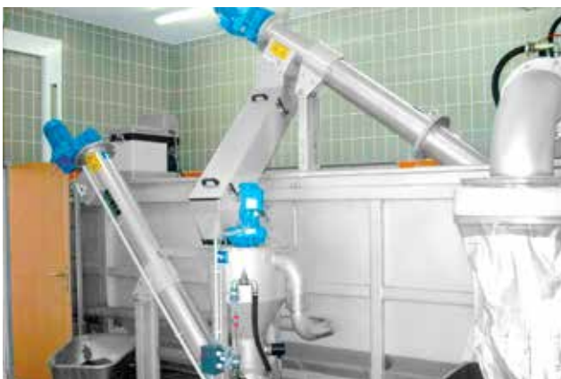
Classifying screw with subsequent HUBER Coanda Grit Washer RoSF4 T.

The settled grit is collected from the bottom of the grit channel with a horizontal grit screw. An inclined grit screw conveys, agitates and dewateres the collected grit. The classified grit slides from the upper end of the inclined screw into a HUBER Coanda Grit Washer RoSF4 T. Optionally, the material can be pumped to the grit washer.