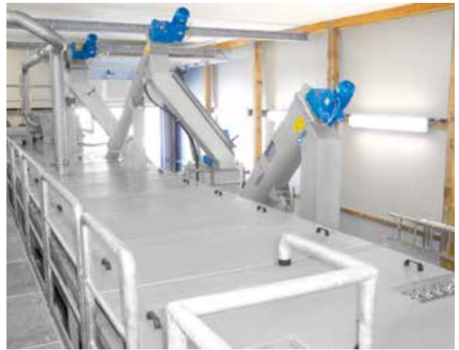
Odour-encased screenings discharge from the HUBER Complete Plant ROTAMAT® Ro5.