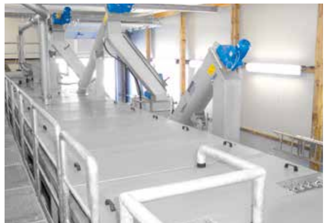
Complete Plant with integrated Grit Washer.

Due to a defined introduction of upwardly directed service water the grit situated within the lower part of the grit washer is fluidised within the flow enabling the lighter organic particles to be separated from the dense grit particles. The separation of the lighter organic particles from the dense grit particles is supported by a rabble rake. After removal of the organic material the clean grit is automatically removed by a classifying screw, statically dewatered and discharged into a container.