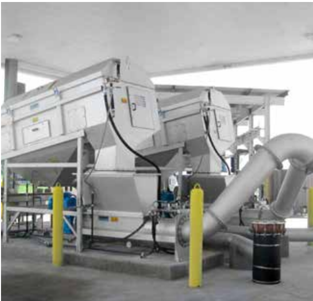
HUBER Wash Drum for washout and separation of all coarse material > 10 mm.