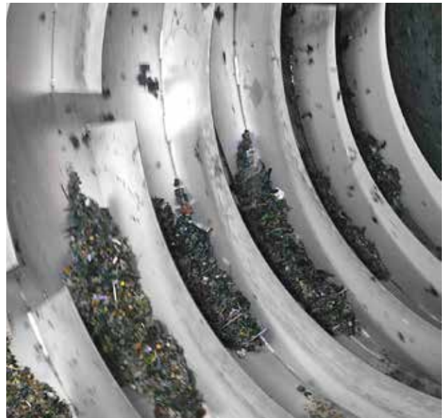
50 l screenings removed per rotation.