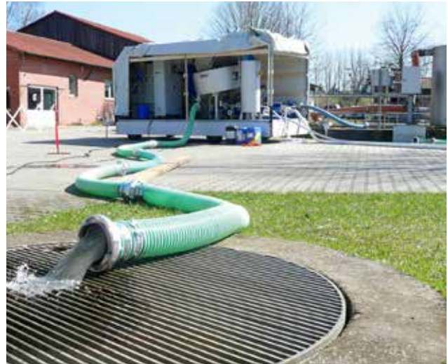
Mobile HUBER Disc Thickener S-DISC mounted on a car trailer, clear filtrate water runs off in the foreground.