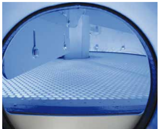
Wear-resistant stainless steel filter cloth.