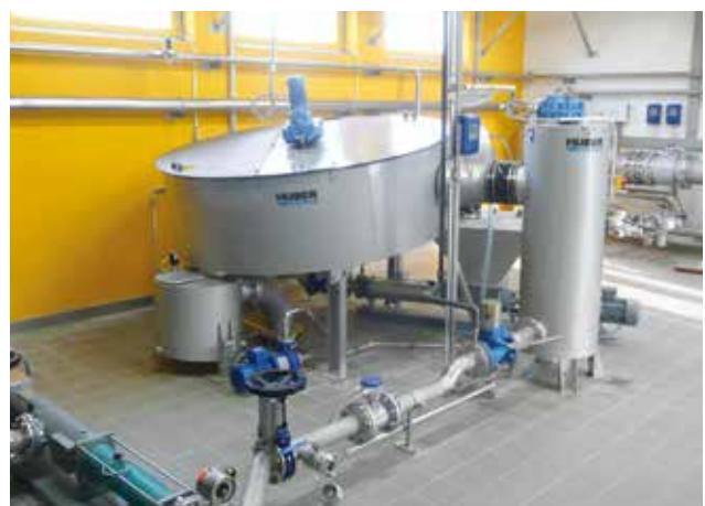
Filtrate storage tank and spray water pump for water recycling.