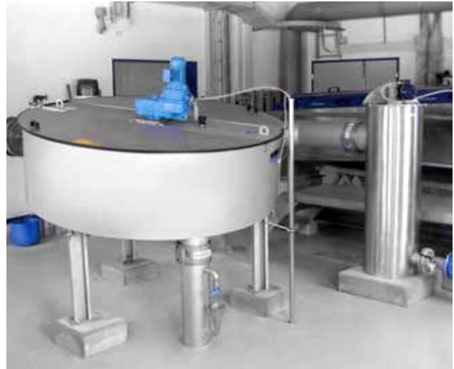
HUBER Disc Thickener S-DISC size 2 with preceding flocculation reactor.