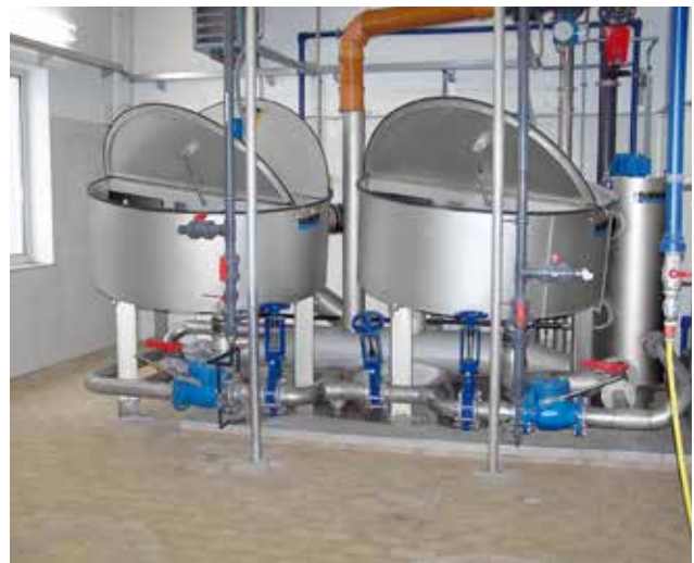
Two units installed in confined space.