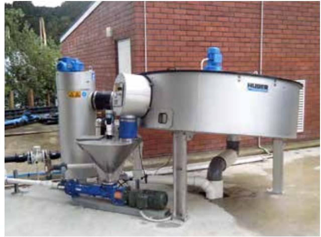
Außenaufstellung eines HUBER Scheibeneindickers S-DISC.