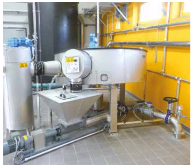
HUBER Disc Thickener S-DISC designed to thicken 35 m 3 /h.