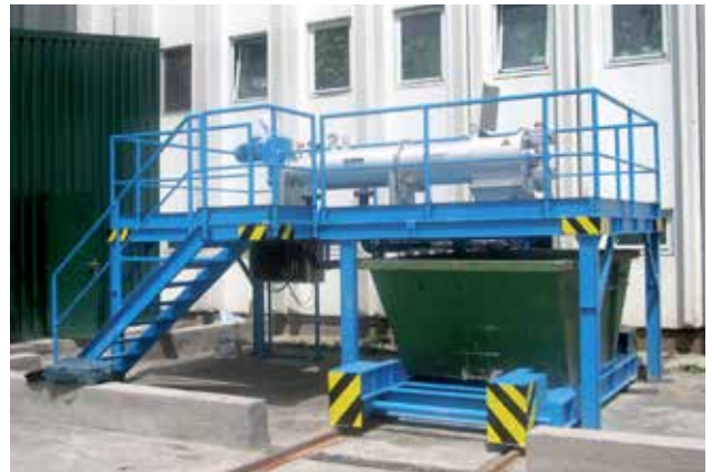
Outdoor installation of a HUBER Sludgecleaner STRAINPRESS® 290.