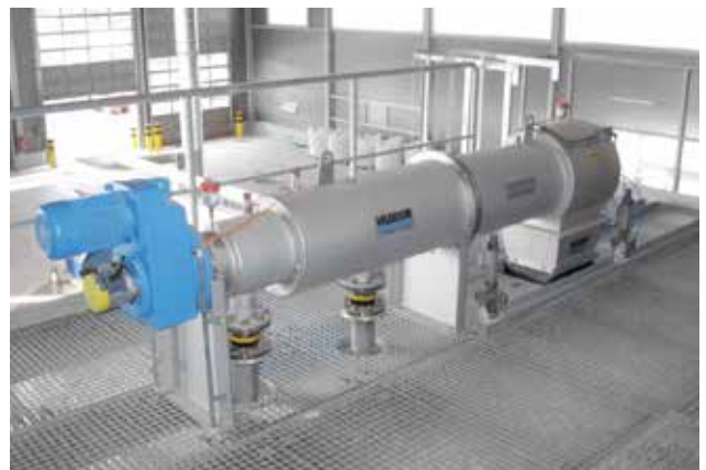
HUBER Sludgecleaner STRAINPRESS® applied for fermentation residue screening.