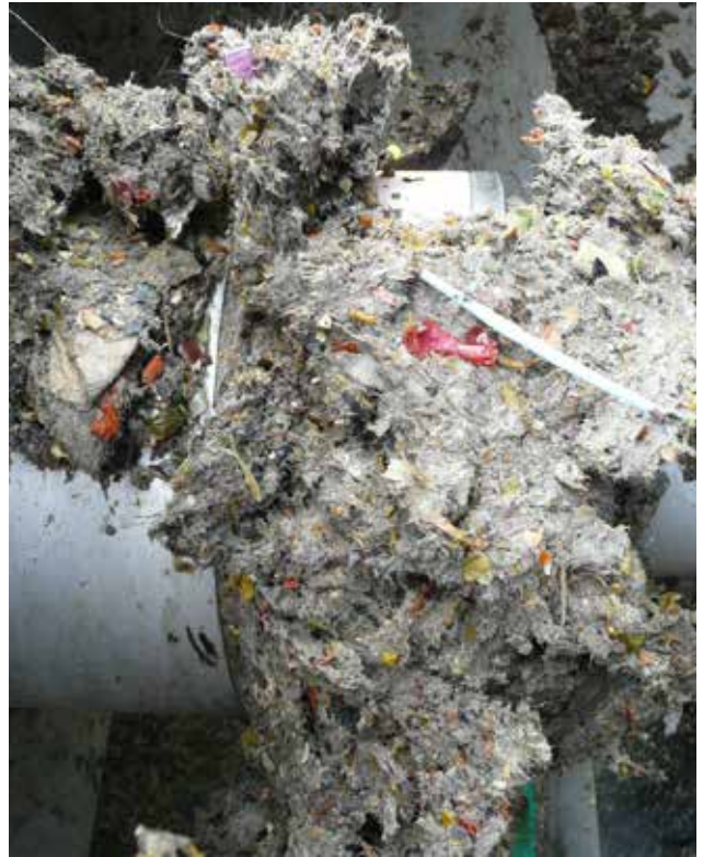
Discharge of the separated dewatered material.