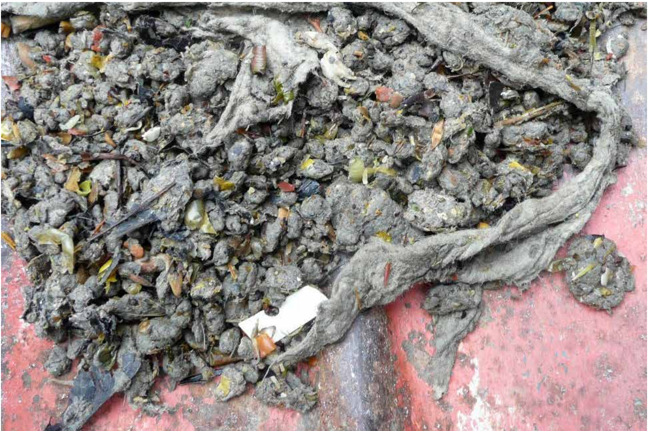
Separated material: wet wipes, leaves, plastics, foils, packaging residues, textiles, etc.